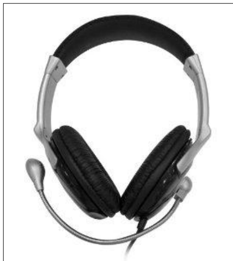
Figure 1. Example Headset (Yapster)

These headsets have the computer standard 1/8 inch line cord plug for the headphone and for the microphone element. This means 2 plugs must be interface to the radio communications equipment that typically would have an 8-pin Foster socket, RJ45 socket, or 1/8 inch plug. Additionally, a means must be provided to provide a push-to-talk (PTT) switch closure for putting the radio in the transmit mode. The Audio Switch Unit (ASU) solves the problem of routing of audio transmit and receive signals and push-to-talk transmit control from inexpensive gamer headphones to the radio equipment.