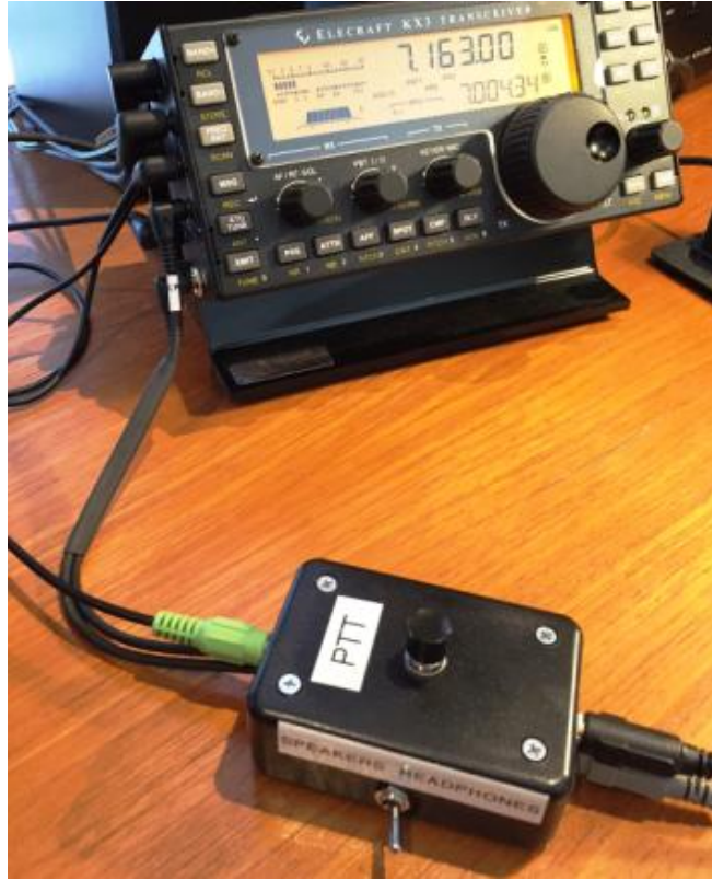
Figure 2. Prototype ASU Connected to KX3 Transceiver Audio Output and Microphone Input