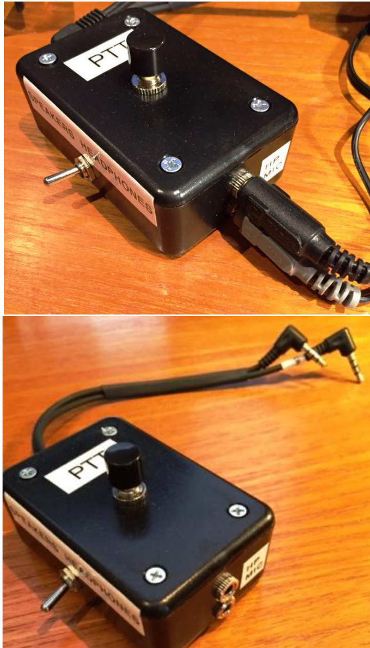
Caption: Plastic enclosure, 2" x 3" x 1"